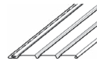
Triple 3 1/2" Hidden Vent