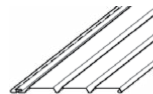
Triple 3 1/2" Solid